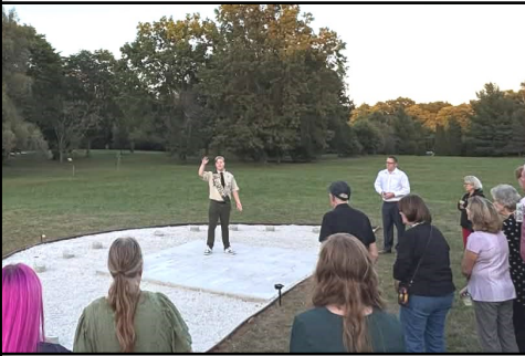
Above: Demonstrating the new sundial

Every year, some of the more intensive projects at Hawthorn Hollow are completed by Boy Scouts working to become Eagle Scouts, the highest rank in the organization. One of the requirements to earn Eagle is to complete a service project benefitting your community, and which requires the Scout to provide leadership to others.