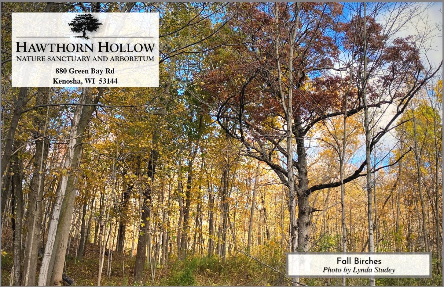
Fall Birches