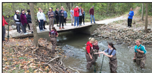
Studying the Pike River

Hawthorn Hollow is proud to be able to provide such a unique laboratory & real-world learning experiences, allowing us to work with such great instructors & students at UW-Parkside. We look forward to continuing this great collaboration!