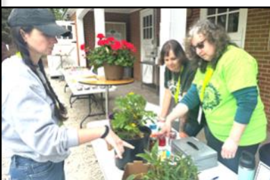
Birds & Plants

While the Concert Series and Art Fair were the main events of the year, other fundraisers like the Friends of Hawthorn Hollow's Birds & Plants sale and the Harvest Hootenanny also saw increased attendance and fundraising as well. Hawthorn Hollow's roster of fall events, known as Hollow-Ween, were also extremely successful, with most events and workshops selling out almost immediately. Thank you to everyone who attended our events for all your support this year!