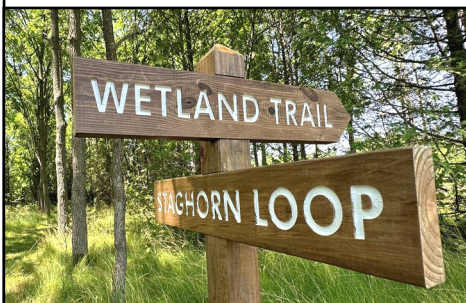
New Trail Signs

The Natural Resource Foundation of Wisconsin awarded Hawthorn Hollow a $1000 grant from the Norma and Stanley DeBoer Quiet Trails Fund. This will fund directional and educational signage for our new 2.5 mile trail system. The Norma and Stanley DeBoer Quiet Trails Fund provides funding to support the creation and maintenance of quiet trails (e.g., walking, hiking, or skiing) in Wisconsin.