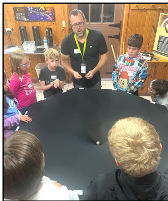
Students at Space Camp taking part in activities both inside and out.