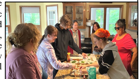
Organic Outreach cooking demonstration with Foodwise/UW-Extension

Down at the Heritage Farmstead, the Organic Outreach program, funded by long-time supporters, SC Johnson and the Racine Community Foundation , is in full swing. The Organic Outreach program employs high school students in sustainable organic gardening and teaches them about the operations of a farm from seed, to harvest, to market.