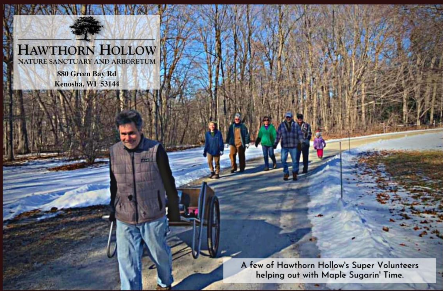
A few of Hawthorn Hollow's Super Volunteers helping out with Maple Sugarin' Time.