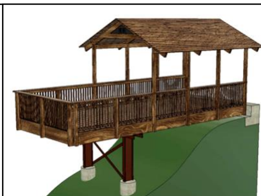
Rendering of the Thursday Morning Club Overlook

A new map of Hawthorn Hollow, including over a mile of new trails through 25 + acres of restored wetlands and pine stands.