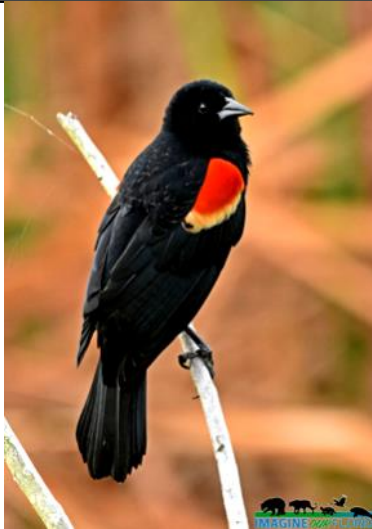
Male red-winged blackbird

In early spring, the male red-winged blackbirds return to Wisconsin to claim their territory near bodies of water and wetlands. These boisterous males can be heard defending their territory in early- to mid-March. They are known to be