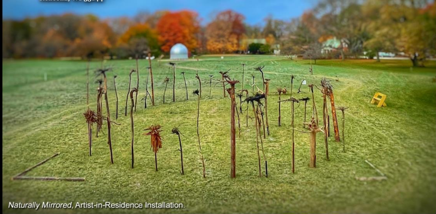
Naturally Mirrored, Artist-in-Residence Installation.